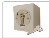
SOMFY 240V with Key Switch