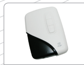
ODS with E-Port