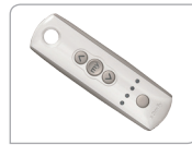
SOMFY 240V RTS with Transmitter